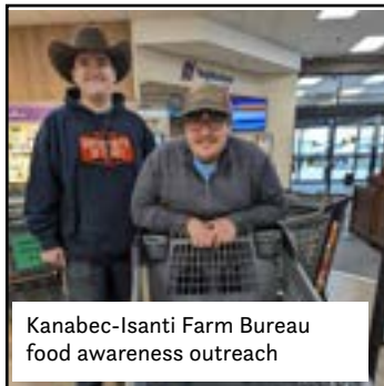
Kanabec-Isanti Farm Bureau food awareness outreach