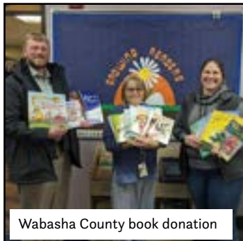
Wabasha County book donation