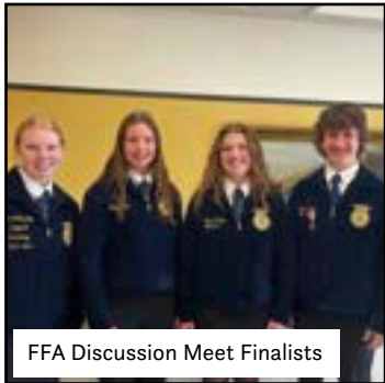
FFA Discussion Meet Finalists