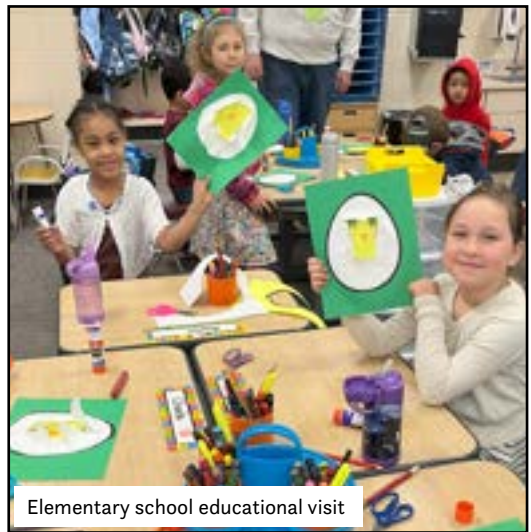
Elementary school educational visit