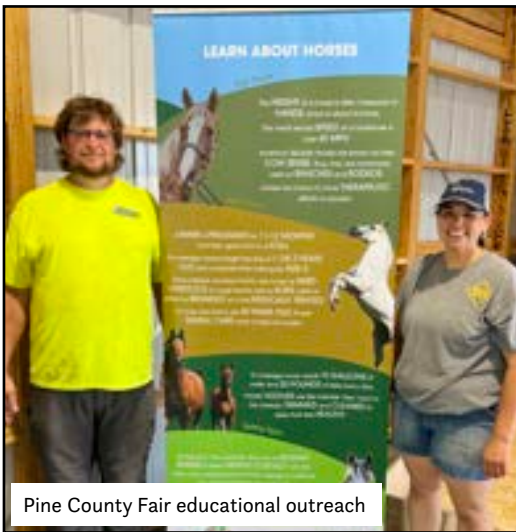
Pine County Fair educational outreach