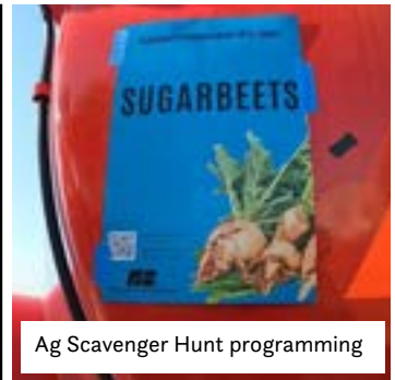
Ag Scavenger Hunt programming