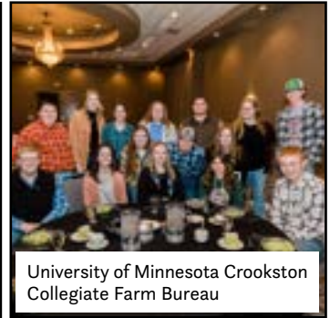
University of Minnesota Crookston Collegiate Farm Bureau