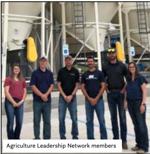
Agriculture Leadership Network members